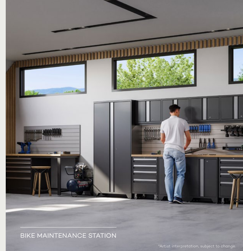
BIKE MAINTENANCE STATION

*Artist interpretation, subject to change.