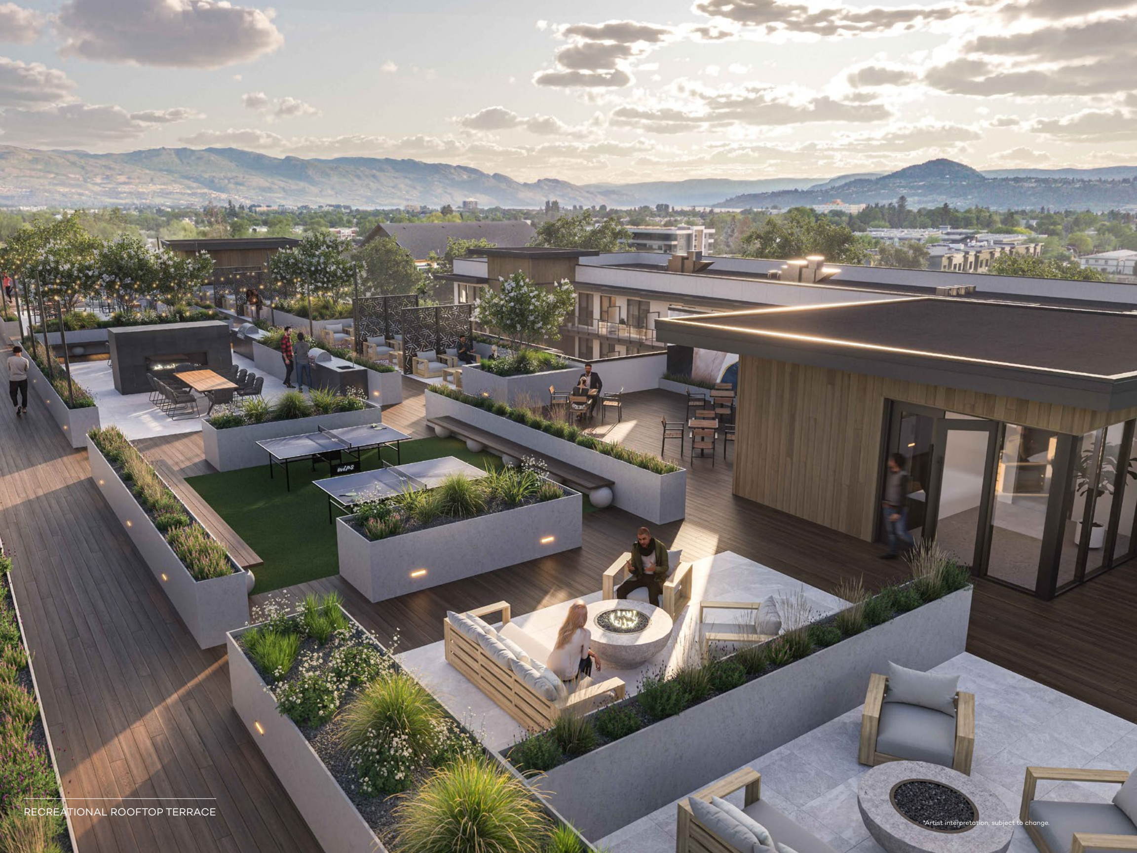
RECREATIONAL ROOFTOP TERRACE

*Artist interpretation, subject to change.